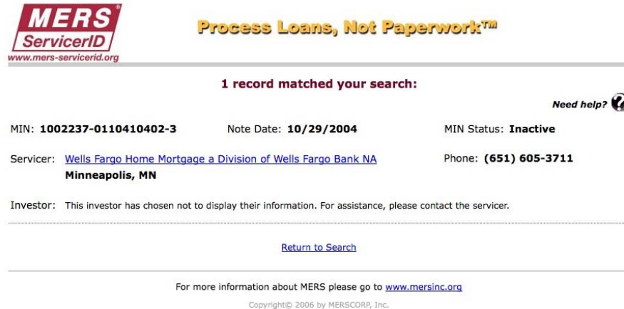
Figure 2: MERS loan search web page screenshot (May 26, 2011), in response to query based on MERS identification number (“MIN”), no investor disclosed: